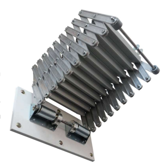
Spring-assisted operation of the retractable ladder (Piccolo Premium)