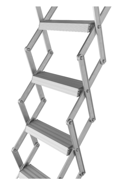
The Piccolo is manufactured from light-weight aluminium profile

Warranty: 2-year full warranty and 10-year parts warranty